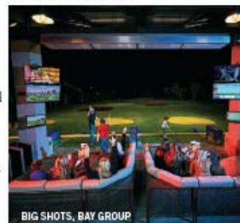
BIG SHOTS, BAY GROUP

The Regal Event Hall ( https://regaleventhall.com ) is a new venue for special events in Port St. Lucie. The modern industrial boutique venue offers over 3,000 square feet of space. m