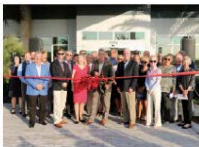
STAR SUITES RIBBON CUTTING, VERO BEACH

Manalapan, unveiled its newly redesigned ballrooms and meeting spaces, which encompass more than 30,000 square feet of indoor space on two levels in the resort's north tower.