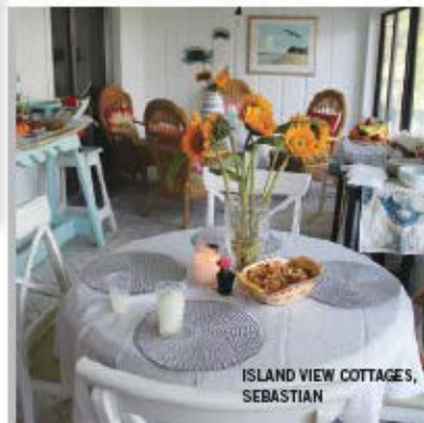
ISLAND VIEW COTTAGES, SEBASTIAN

The highly anticipated Star Suites By Riverside Theatre in Vero Beach held a ribbon cutting in early March. The 60-suite facility was created to accommodate out-of-town actors, designers and artists who work or perform at Riverside Theatre, but rooms that are not needed by the theater will be